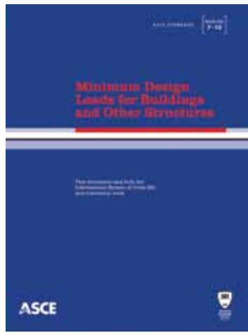
Figure 2. ASCE 7-10 wind, seismic, and snow loads used.