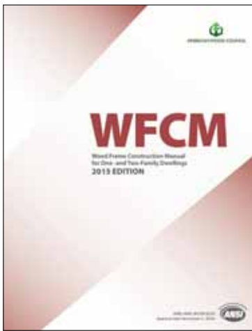
Figure 1. 2015 WFCM in 2015 IBC/IRC.