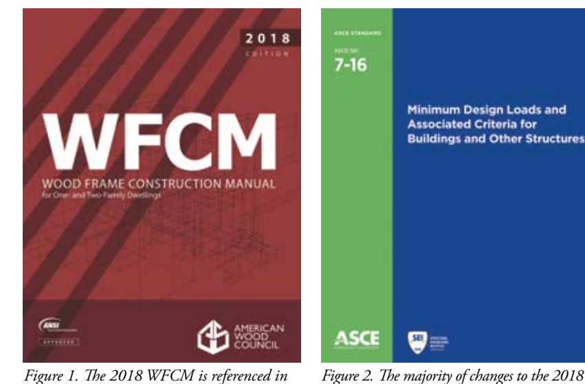
Figure 1. The 2018 WFCM is referenced in the 2018 IRC and 2018 IBC.

Reprinted with permission by STRUCTURE® magazine June 2018