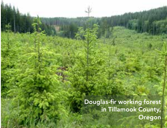
Douglas-fir working forest in Tillamook County, Oregon

On national forests in the U.S., for example, conformance with the National Forest Management Act (NFMA) requires the