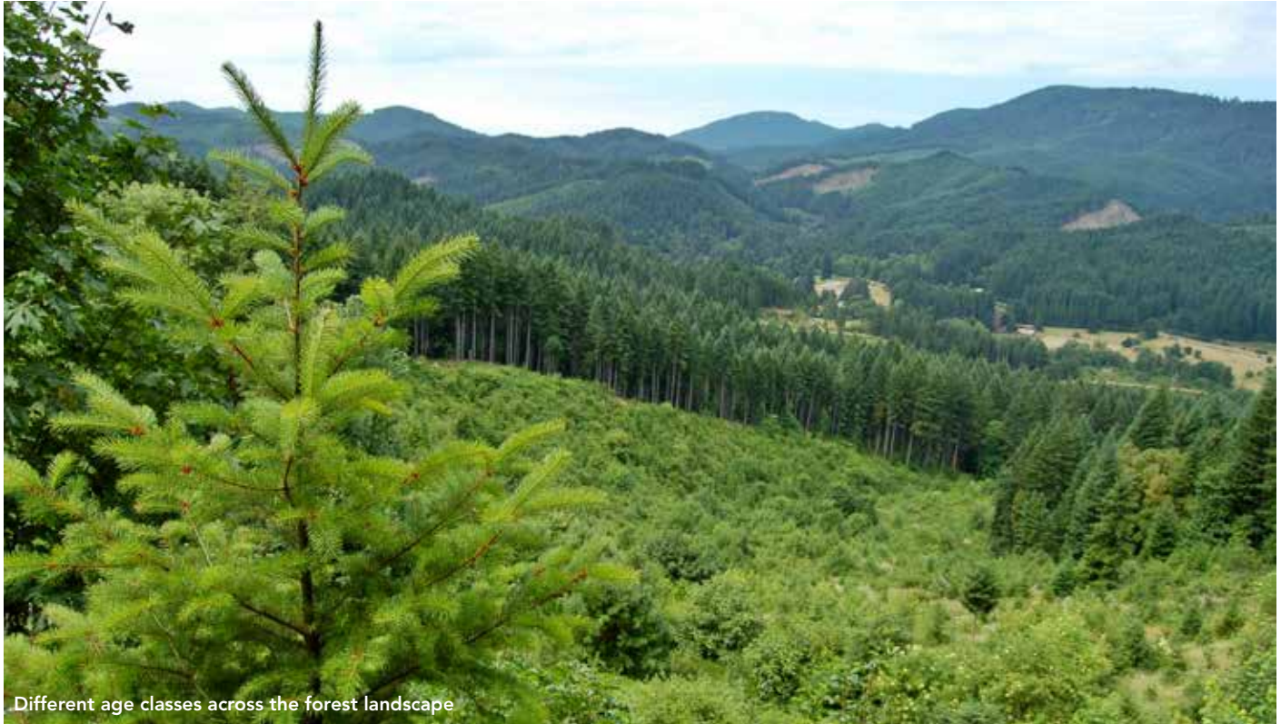
Different age classes across the forest landscape