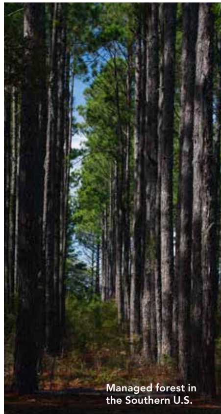
Managed forest in the Southern U.S.

depend on third-party audits where independent auditors measure the planning, procedures, systems and performance of on-the-ground forest operations against the predetermined standard. The audits, performed by experienced, independent foresters, biologists, socio-economists or other professionals, are conducted by certification bodies accredited to award certificates under each of the programs. A certificate is issued if a forest operation is found to be in conformance with the specified forest certification standard. 11